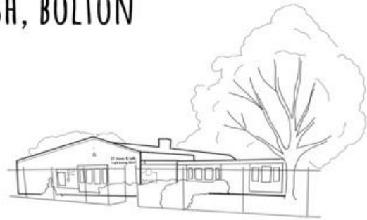
S S SIMON & JUDE