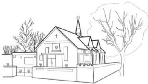
ST GEORGE WITH ST JAMES